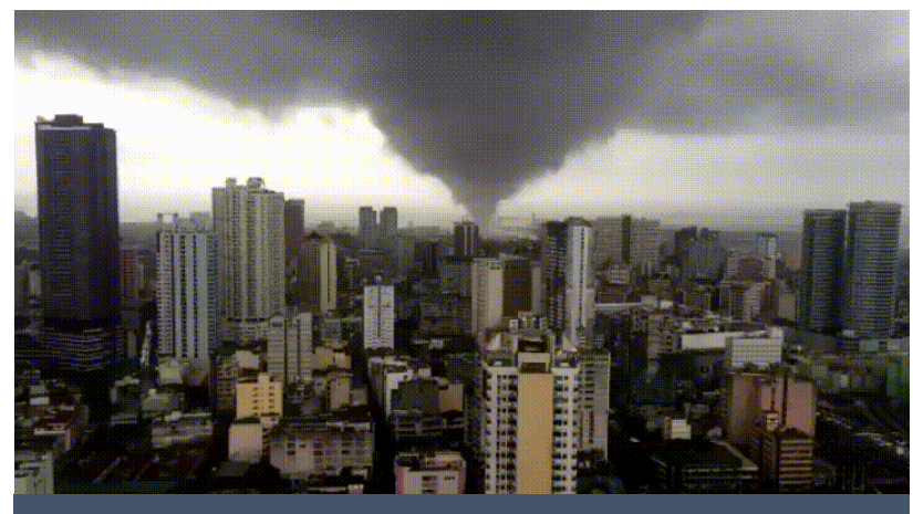
Tornado hits Manila – 2016