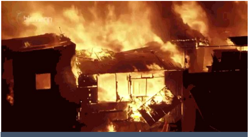
Fire hits Pasay City - 2016