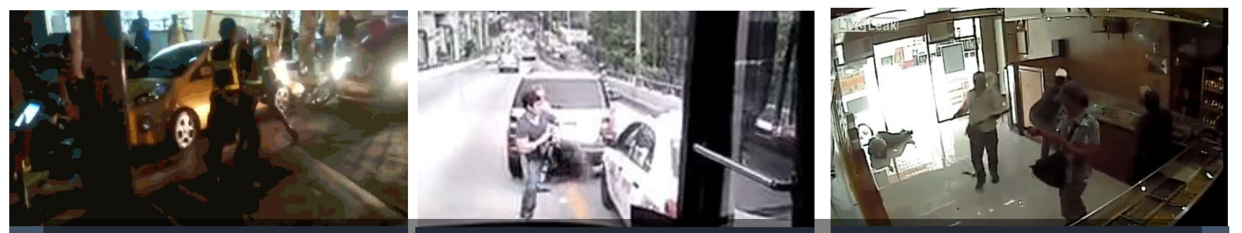
Vehicular Emergencies – Skyway/ SLEX