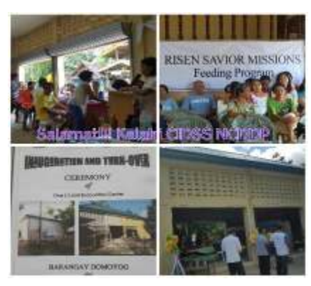
DSWD KC NCDDP Program in LGU Del Carmen has already completed and sustained more than 60 small projects in the various villages