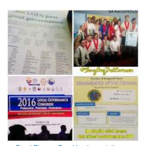
Good Plans + Good Implementations = Good Credibility