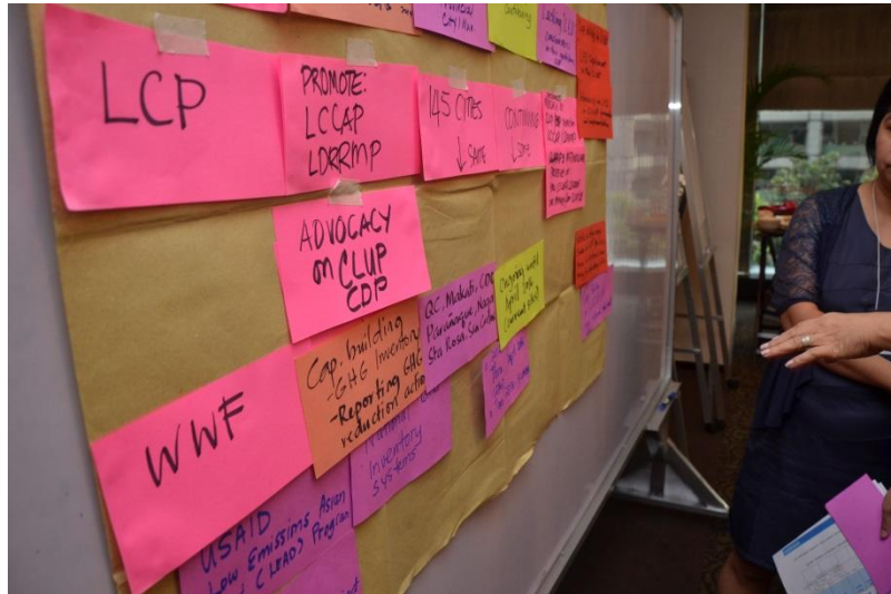
VLED Inception Workshop, Dec 7, 2015

The role of cities in stimulating urban climate actions has always been recognized