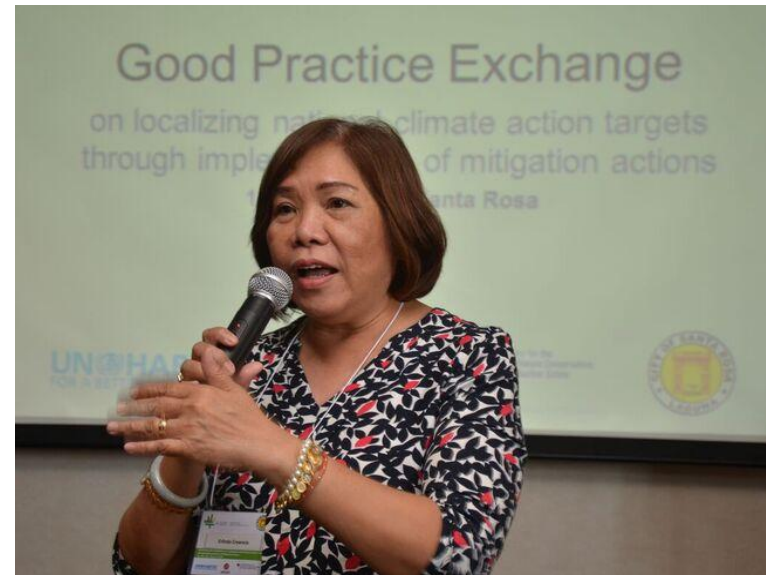
Sta. Rosa City

Horizontal exchanges Good practice exchanges, learning and sharing