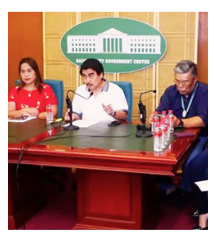
Above left: The COVID-19 LGU Watch serves as the League's flagship advocacy to document and promote city government responses to COVID-19; above middle: LCP Chair and Cebu City Mayor Edgar Labella (leftmost) establishes Cebu Emergency Operation Center to closely monitor updates on the COVID-19 situation in the city; above right: LCP President and Bacolod City Mayor Bing Leonardia orders the closure of classes and suspension of graduation ceremonies after President Duterte declared a state of public health emergency.

Bernadette Romulo-Puyat revealed the agency's new direction of boosting domestic tourism in light of the COVID-19 pandemic. The DOT secretary also reported on programs geared towards providing support to LGUs for their tourism projects.