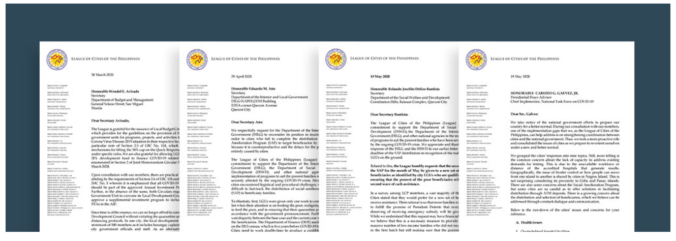
The League sends executive correspondences to heads of national government agencies to make sure that the concerns of city mayors are directly communicated to the national government during the ongoing pandemic. These letters aim to strengthen alignment between the local and national governments on various strategies to address COVID-19.

the implementation of the BE-LCP as well as the key roles of LGUs. The League also disseminated a policy brief on salient points for the localization of the BE-LCP to guide its member cities.