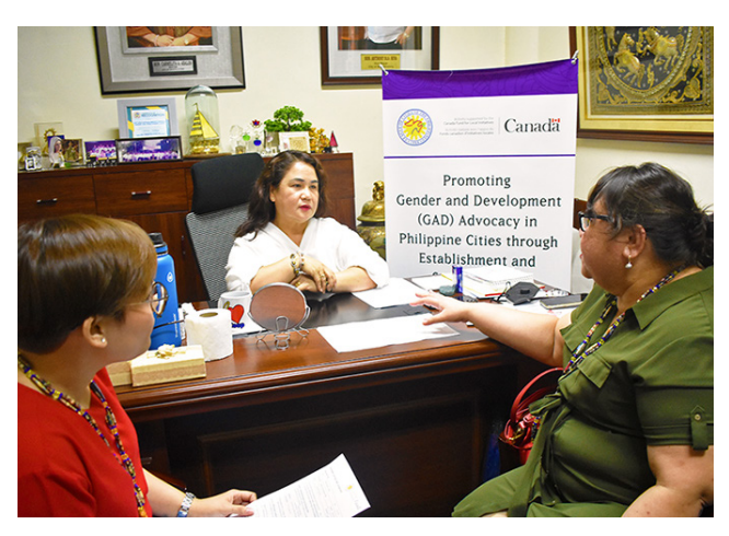
Above left, right: Members of the League's GFPS Project visit the LGU of Mandaluyong City to gather information on the local government's gender and development (GAD) activities, particularly best practices and challenges in mainstreaming GAD in local strategies and programs

government by ensuring that the laws supporting Sustainable Development Goals (SDGs) are properly and effectively implemented; help local governments in institutionalizing national laws at the local level; gather new perspectives and approaches in monitoring and reporting SDGs; and strengthen the organization's grasp of gender-responsive local governance. The proposal also aims to complement the League's ongoing project on creating and strengthening GAD Focal Point Systems in cities.