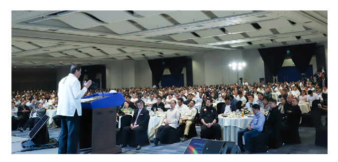
President Duterte speaks before local chief executives at the presidential dialgoue on 10 February 2020 to address the coronavirus situation and provide instructions for local action.

On 04 February 2020, the League attended the public hearing of the Senate Committee on Health and Demography to gather updates in the response of the national government to the 2019-nCoV. It was in this meeting that the Department of the Interior and Local Government (DILG) made mention of a memorandum circular directing local governments to establish barangay health emergency response teams.